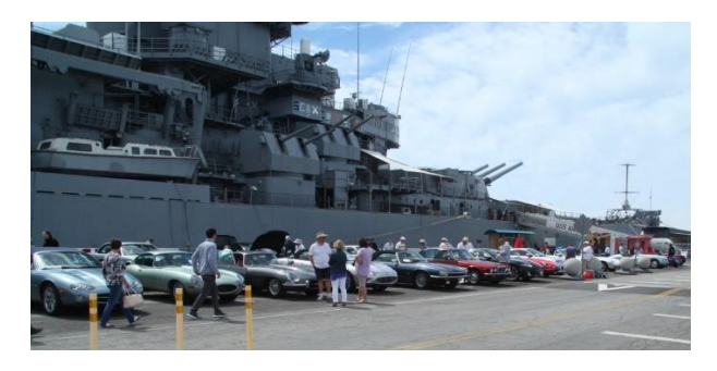
41 Jags lines up on the starboard side

With forty-one Jags lined up on the starboard side of the ship, there was some question as to whether the Iowa's big 16-inch guns were protecting our Jags, or whether our Jags were running escort for the world-famous battleship. What do you think?