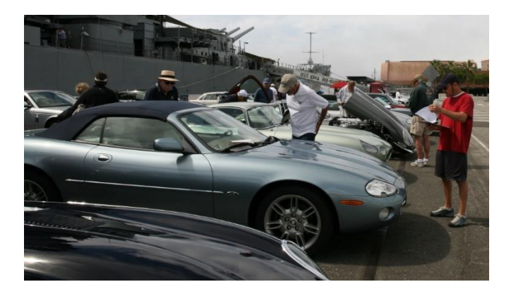
Judging the Jags at the show

Depending on their judging time, some members toured the ship before their Jags were judged, while others toured after.